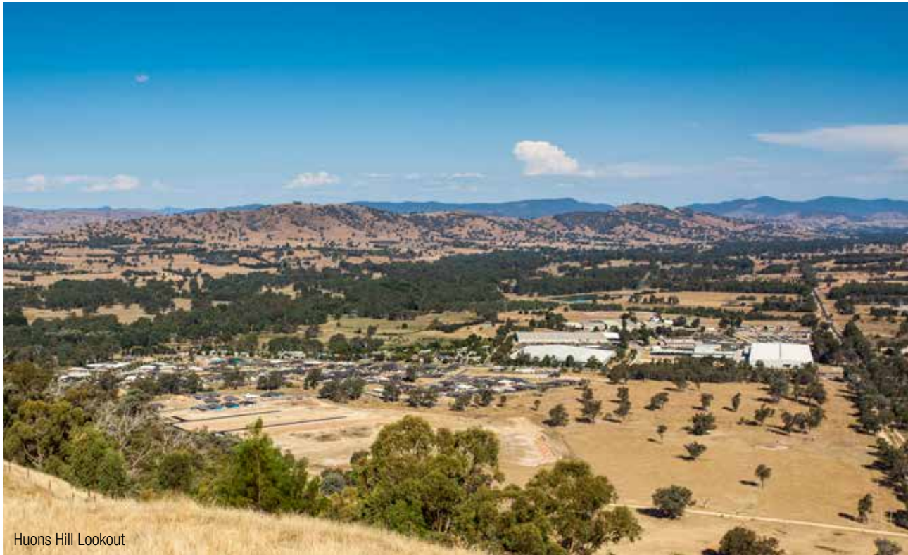
Huons Hill Lookout

Capital growth over the last 36 years has averaged 8.06% (source: Fisher Murphy Valuers) providing a solid increase in the value of property over that time and forecasts from Residex indicate they anticipate Albury-Wodonga will enjoy the 2nd highest growth rate in the state at 4% p.a. over the next 5 years.